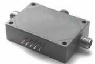
SPDT module shown above with SMA connectors